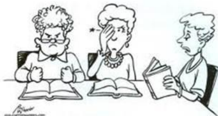
In the spirit of unity, perhaps we should suspend our discussion on the tough passages of Scripture until next week.